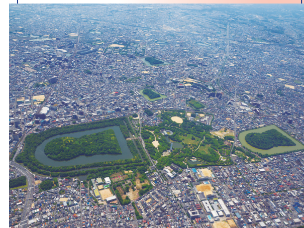
Left photo: Nintoku-tenno-ryo Kofun Right photo: Richu-tenno-ryo Kofun

This very beautiful park, located in an area filled with greenery and a historical atmosphere between two mounded tombs—the Nintoku-tenno-ryo Kofun and the Richu-tenno-ryo Kofun—is a symbol of Sakai City.