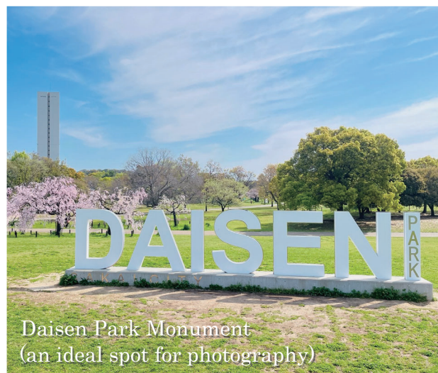
Daisen Park Monument (an ideal spot for photography)