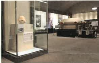
[Above] Exhibition Room (Ancient Age)