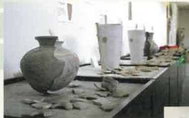
Activity Corner (free) Let's feel 3D puzzles of potteries and haniwa, or reproduction of bronze mirrors.