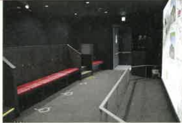
[Right] Mozu Kofungun Theater (free) You can enjoy an aerial walk over the huge mounded tombs in Mozu with a 200-inch screen.