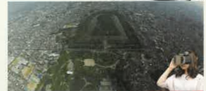
[Redacted] Theater (charged)