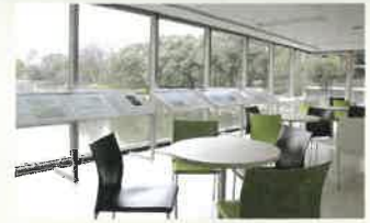
Mozu Kofungun Exhibit Corner (Break Area, free of charge)