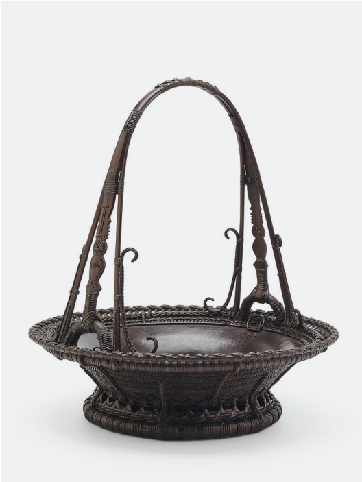
②Maeda Chikubosai II Sphere: flower basket 1999, Sakai City Collection ③Maeda Chikubosai I Greaves styled Hand Warmer Mid-Meiji - early Showa era, Sakai City Collection