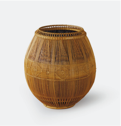
①Maeda Chikubosai II Double-layered flower basket with interlocking ring pattern Showa - Heisei era, Sakai City Collection ②Maeda Chikubosai II Flower basket Showa era, Sakai City Collection