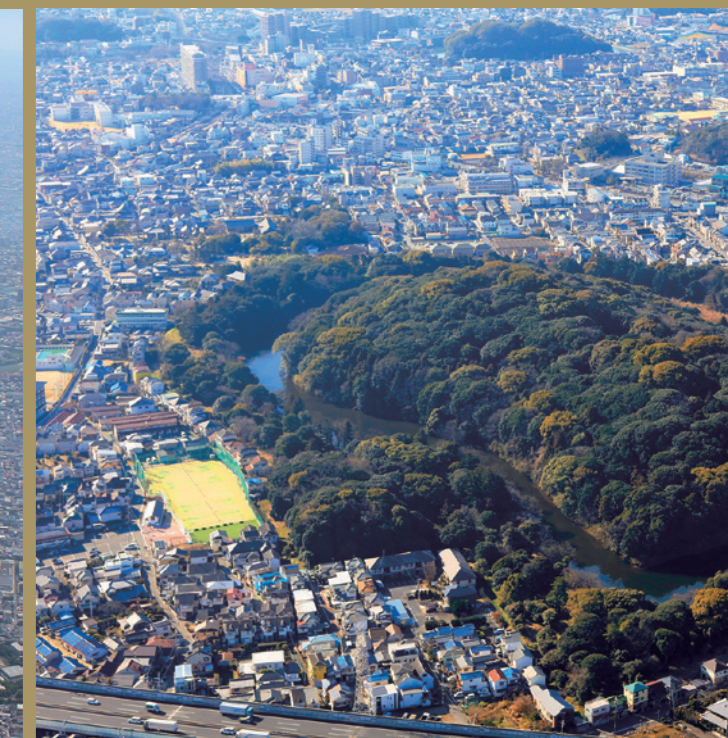
No.21 Nisanzai Kofun