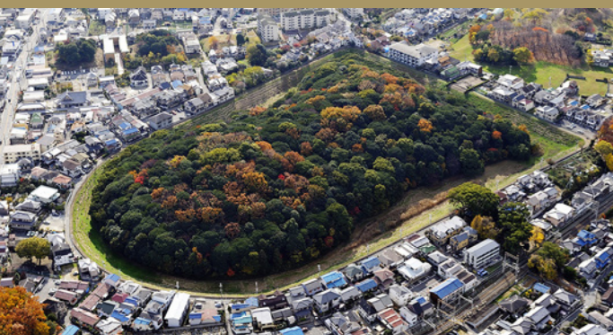
No.26 Nakatsuhime-no-mikoto-ryo Kofun