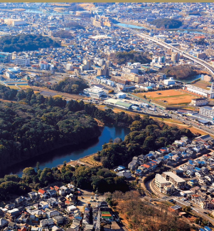
No.33-1 Ojin-tenno-ryo Kofun