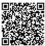
Osaka Disaster Prevention App

Photochemical smog tends to occur during the daytime when temperatures are high and winds are weak. When photochemical smog forecasts or warnings are issued, flags (green for forecast, yellow for precaution, orange for warning) and signs indicating 'Photochemical Smog Forecast Issued' will be displayed at public facilities such as ward offices and schools. During the issuance, avoid strenuous outdoor activities. If your eyes feel irritated or your throat hurts, please rinse your eyes and gargle. Additionally, Osaka Prefecture provides an information distribution service via email and app, so please register (you can select the displayed language within the distribution service). Please scan the QR codes to register for the email and download the app.