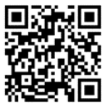
Osaka Disaster Prevention Email