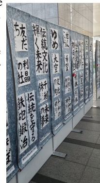
Last year's display

Venue: Sakai City Hall, Main Building, 1F Entrance Hall