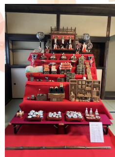
Photo from last year's exhibition

For details on admission fees and opening hours, scan the QR code.