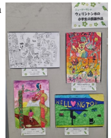
Last year's display