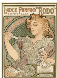
Alphonse Mucha, Rodo Perfume (Lance) , 1896, Lithograph on paper, Collection of the Sakai Alphonse Mucha Museum