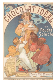
Alphonse Mucha, Chocolat Idéal , 1897, Lithograph on paper Ogata Collection